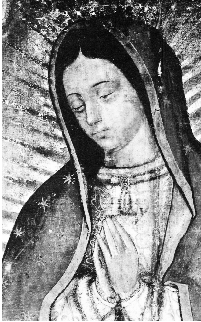
OUR LADY OF GUADALUPE PATRON OF THE AMERICAS